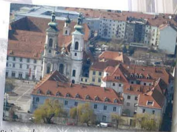
Das Land, Steiermark

'...There were two main dynamics behind the events which led to the establishment of the ECML... The Modern Language programme continued to be under-funded. There was a pressing need for a longer-term dedicated structure. And then there was the fall of the Iron Curtain, which led to a changed situation in terms of education and particularly in the focus of language teaching in Europe. Suddenly, the possibilities for co-operation between formerly isolated neighbouring countries were concrete, abundant and feasible. Inspired by the strategical geographical situation in which it found itself, Austria was the first to put forward the proposal of hosting a permanent European language centre...'