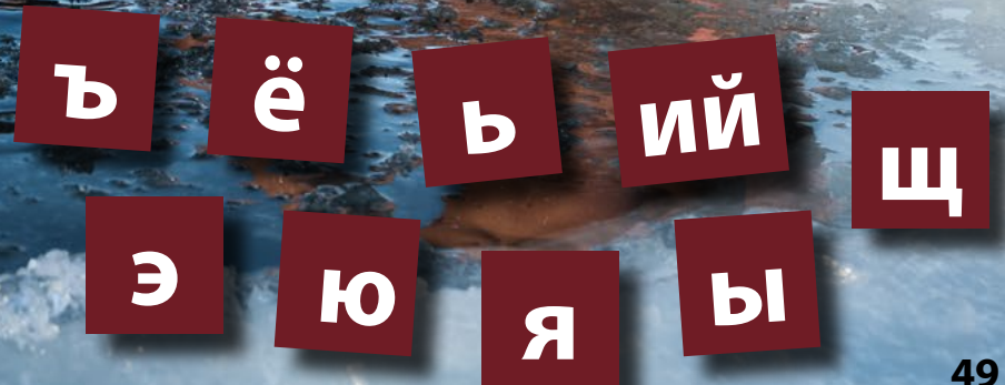
Photo: Swimming in an ice hole, Russia