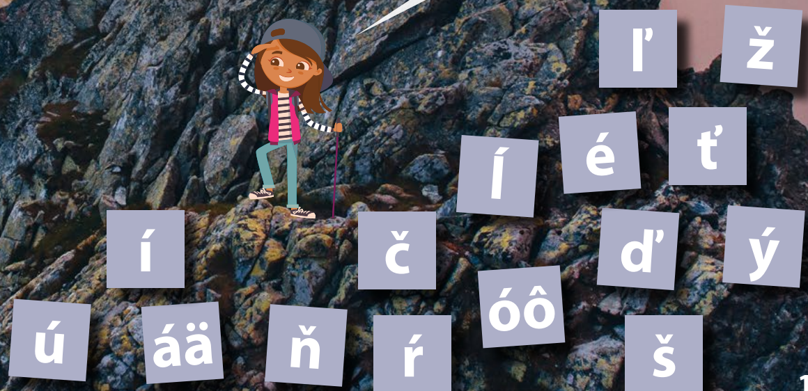
Photo: High Tatras, Slovak Republic