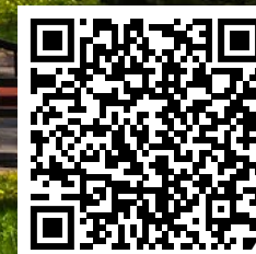
Photo: Park in Minsk, Belarus